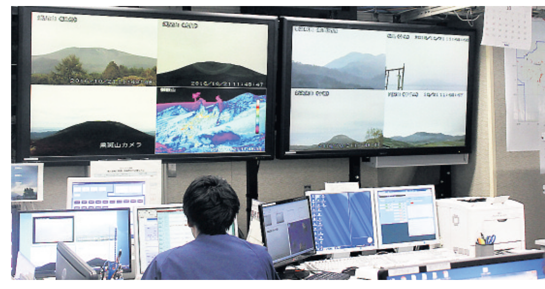
A section at Japan Meteorological Agency headquarters in Tokyo that monitors real-time volcanic activity across the country.

Schools and community groups rallied to create awareness and exit plans with volunteer teams often staffed by high-school students.